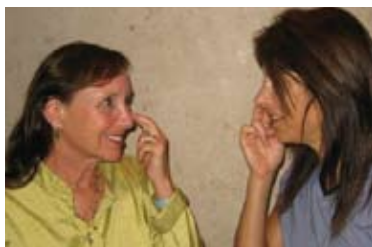
Thought field therapy is used to help clients “take the charge out of emotional issues.”